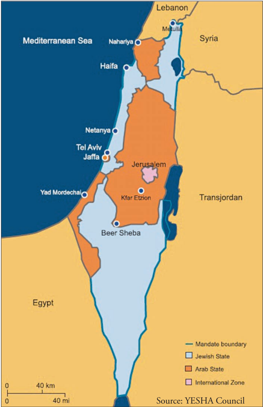
Map 2: The Partition Plan (1947)