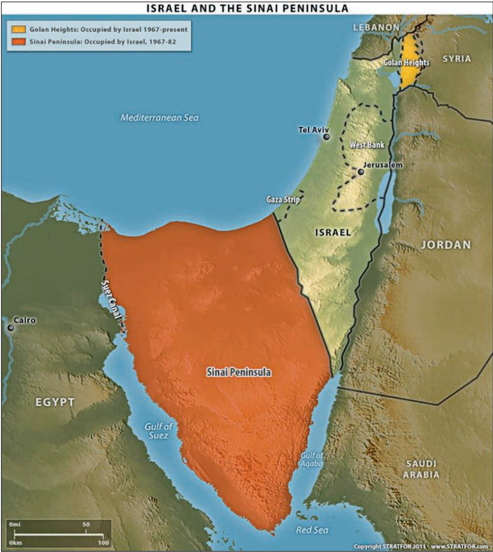
Map 5: Israel after the peace treaty with Egypt (1982)