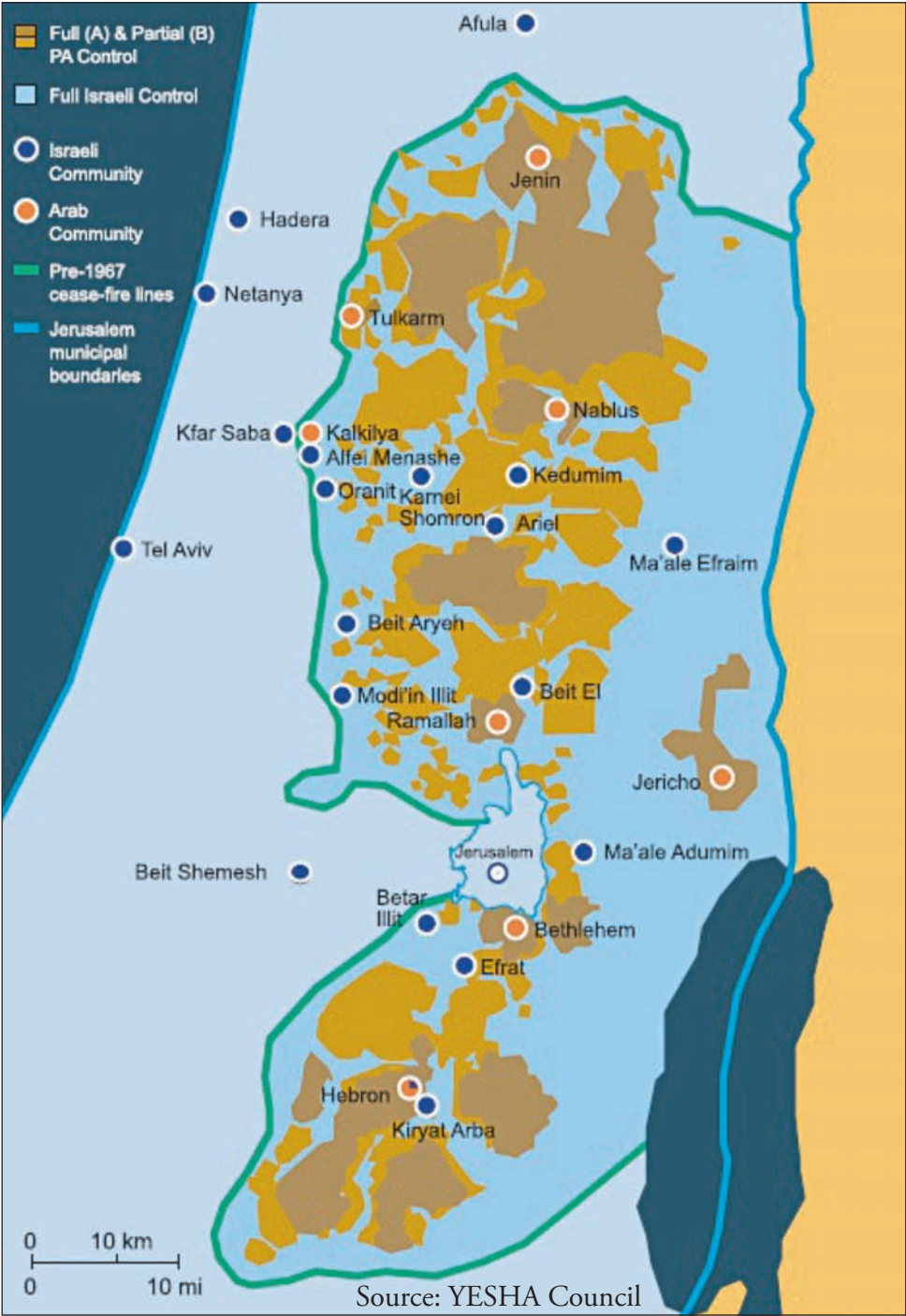
Map 6: The Oslo Agreements (1993)